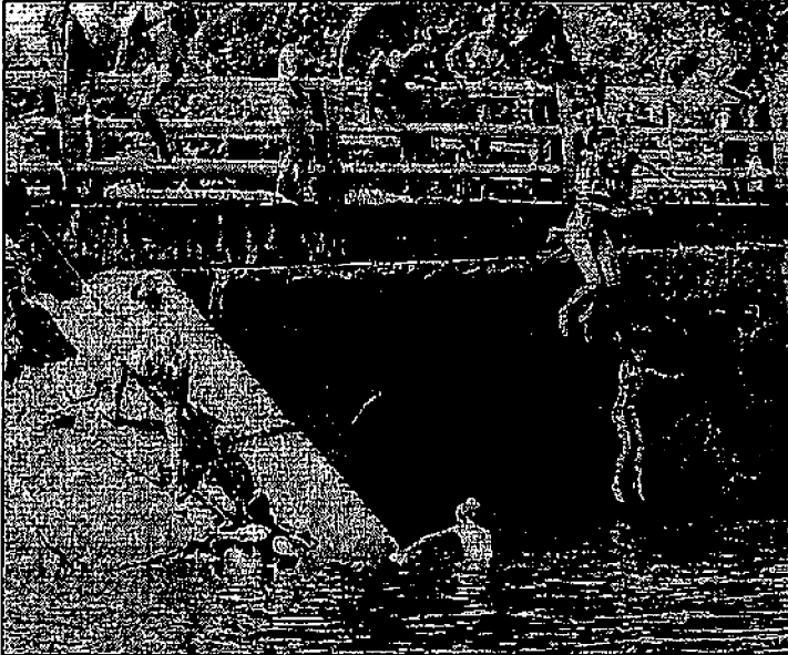
Jumpers head into the water at high tide at the Blue Fish River.